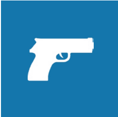
ARMED AND OTHER THREATENING VOTER INTIMIDATION TACTICS

County clerks and other local election workers have faced consistent harassment, leading to many leaving their posts — and in some places, election deniers signing up to replace them. Among the ongoing pressing threats impacting elections and election workers in this critical battleground state include: