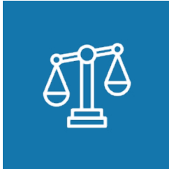
ANTI-DEMOCRATIC POLL WORKER RECRUITMENT EFFORTS