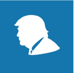
BIG LIE FORCES THAT TRIED TO OVERTURN THE 2020 ELECTION

Leveraging DTV-AF’s expertise and on-the-ground relationships, DTV-AF’s efforts are strategically focused on providing essential services and resources including, but not limited to: the recruitment, training, and support of election workers; stopping political violence, intimidation, and misinformation; and voter registration and education.