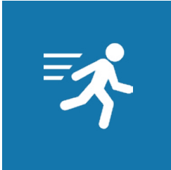
ELECTION OFFICIALS LEAVING IN RECORD NUMBERS